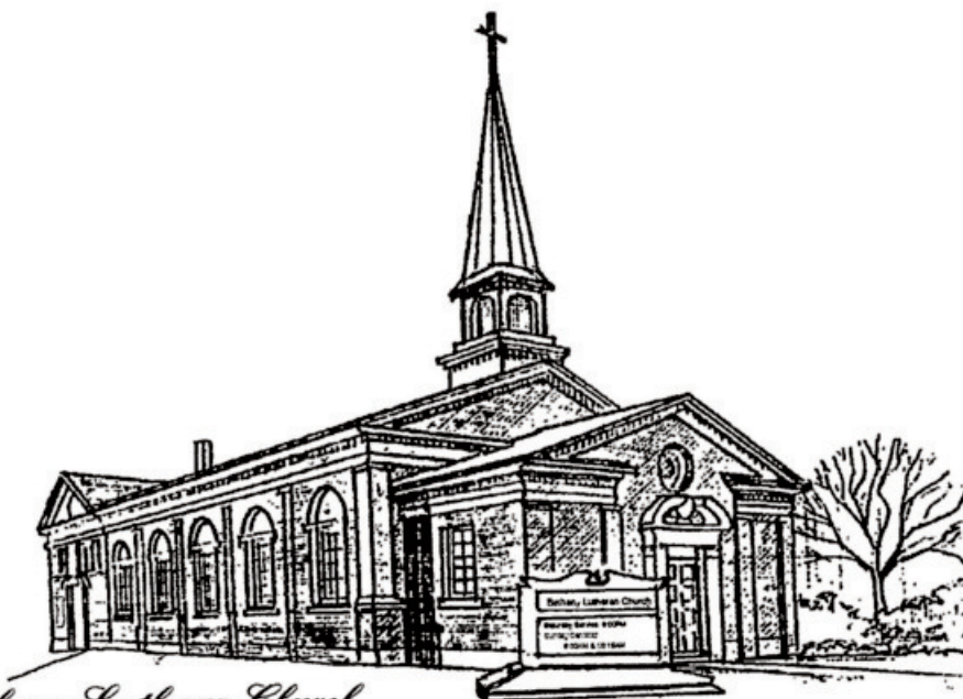
Bethany Lutheran Church Palmyra, NJ