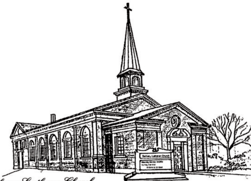
Bethany Lutheran Church Palmyra, NJ