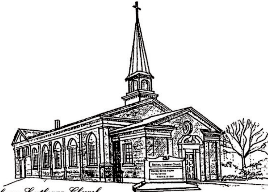
Bethany Lutheran Church Palmyra, NJ